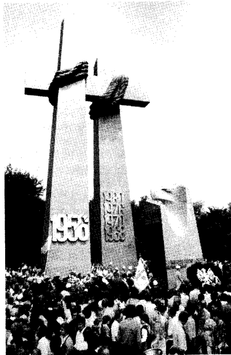
Poznan Monument Commemorates Antibureaucratic Uprisings Inscription: «For Freedom, Justice, Bread.»

That is why the regime is forcing the workers to do their jobs under the guns of the military. It cannot run an economy at gunpoint. But the Polish Stalinist bureaucracy